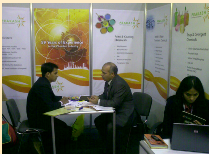
Deibrations at EgyCoat-2010, Calro