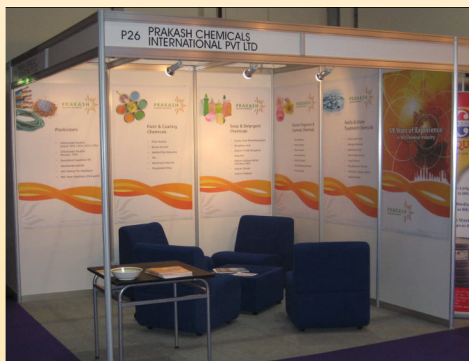
Stand at Middle East Coating Show-2010, Dubai